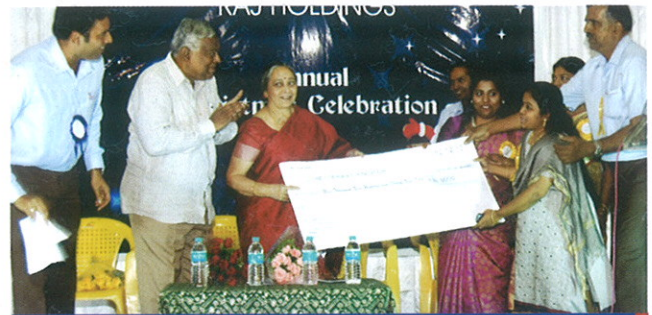
Senior staff handing over the cheque

It was a moment of great joy for the Trustees, when the staff of Raj Holdings generously handed over a cheque for Rs. 10,000/- towards The Cherian Foundation activities. The trustees thanked them for their support, commitment and active participation in the company's CSR activities.