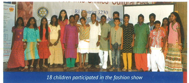
18 children participated in the fashion show