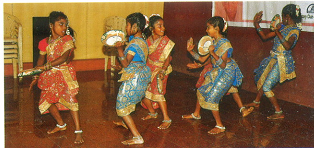
5th std girls from Sembasi Kuppam School performing at the group dance competition, MCTM Boys Hr. Sec. School during Schools into Smiles Cultural Fest

243 children and 36 accompanying teachers from govt and panchayat schools participated in the cultural festival this year. The various categories included fancy dress, singing, group dance, street play, and painting competition. The topics for the same were on social issues. For the first time, we conducted an essay