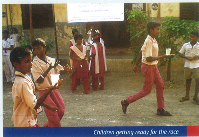
Children getting ready for the race