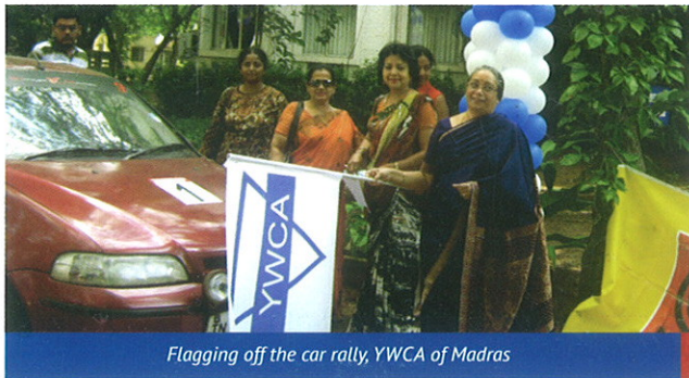
Flagging off the car rally, YWCA of Madras