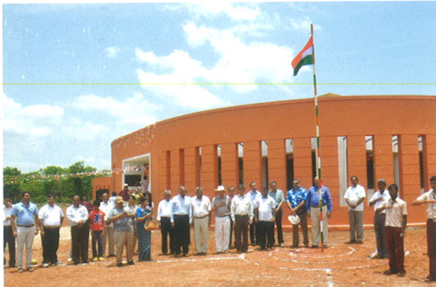
Inauguration of the residential block at CREATE, Gummidipoondi

The residential block at Boys Town, Gummidipoondi sponsored by our Managing Trustee was inaugurated as part of CREATE Project (Centre for Rural Education, Advancement, Transformation and Empowerment). All the boys under the care of the residential facility come from nearby villages and they are from families which are financially unstable. Most of them suffer the effects of communally discriminative policies and domestic violence. They