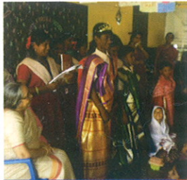
Skit by Rotary Model School Children.

We shared the joy of Christmas by distributing cakes for the children of our adopted schools (Social Service League School and Rotary Model School). The children sang carols and performed skits, making the occasion very special.