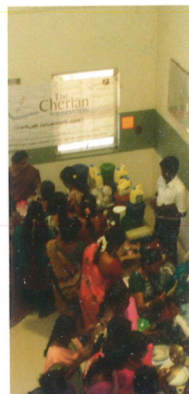
Sale at Alinjivakkam

The price for the items started as low as Rs 5 for the benefit of the workers. We were able to raise a total sum of Rs 31,879 from the sales. The amount will be utilized for the various projects of Chieran Foundation. Thank you Raj family for your support