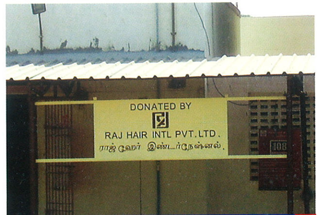
Newly built outpatient wait area shed at PHC, Panchetty