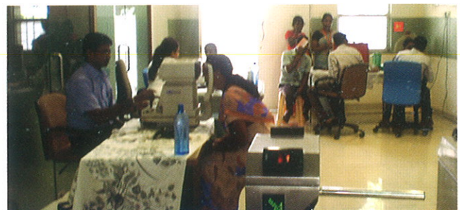
Eye Checkup done by a team of doctors from Rajan Eye Care Hospital

An eye camp was conducted for the staff at Head Office on 14.07.2012, and for the workers at Raj Hair Intl factory on