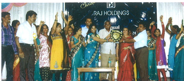
Handing over the trophy to the winning team

One of the most looked forward to events in the Foundation's yearly activities is the cultural day for the staff and workers of Raj Global Holdings. This year, once again the bench mark was raised