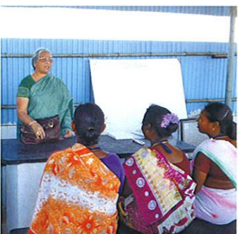
class in progress at Mugappair

New batch was started at Alinjivakkam on 16th April with 25 candidates. Similarly new batch was started at Mugappair on 23rd April. 16 candidates enrolled for the programme and a few students from the old batch, who were slow learners, re-enrolled. We issued new slates for the 2nd batch on 7th May at Alinjivakkam.