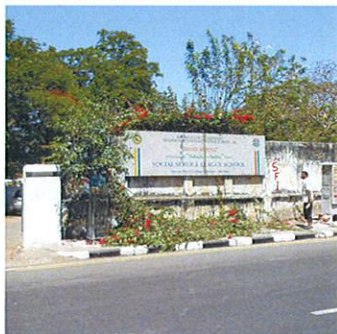
View of school premises after cleaning

Director took the initiative to clear the overgrown bushes in the Social Service League School premises on 27th March 2015.