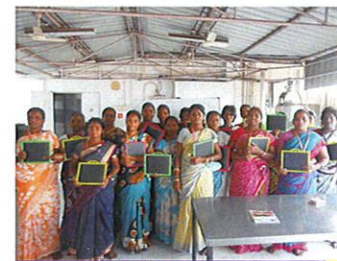
Kit for 2 nd batch students