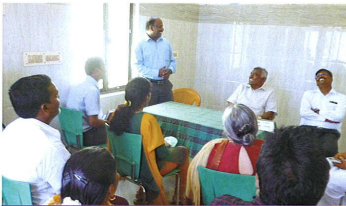
Corporate and Medical Team Meeting