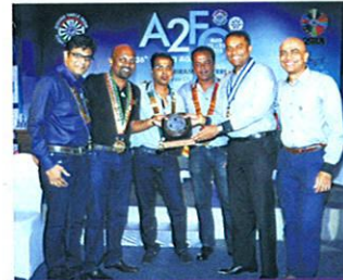
Awards for executing outstanding activities in MMRT-42