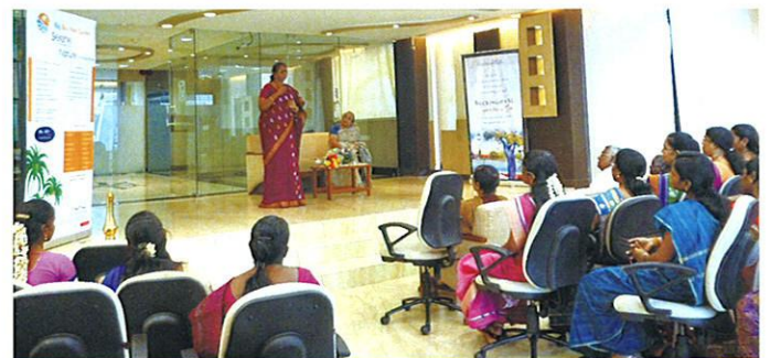
Chief Guest addressing the gathering

She is the Chairperson of Regional Council, International Planned Parenthood Federation and the National President of Family Planning Association of India. She delivered an inspiring speech, sharing the status of women in other countries.