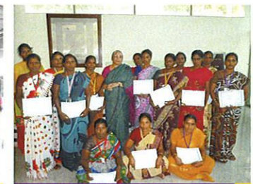
previous batch students

12 Literacy students from Alinjivakkam received certificates and a gift worth Rs. 100, during the Annual Christmas Celebration of Raj Holdings for their outstanding performance.