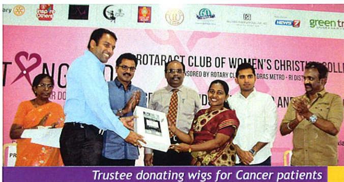
Trustee donating wigs for Cancer patients

Tangled was inaugurated on World Cancer Day 2014 by the Rotaract Club of Women's Christian College, Chennai in association with Raj Hair Intl Pvt. Ltd & Green Trends Salon. The hair is collected at Green Trends Salon outlets and sent to Raj Hair International to be made into wigs. This campaign witnessed the support of over 3500 willing donors across Tamil Nadu donating locks of hair across the state. With the overwhelming success in the state, the initiative was also replicated in Bangalore city where women of varying age groups came forward to donate their hair. In 2014, we donated 120 wigs to the cancer patients.