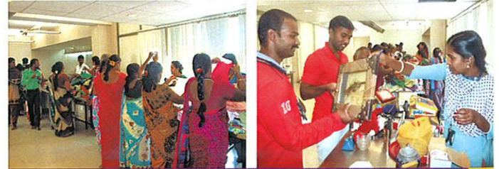
View of Charity Bazaar

Every year, The Cherian Foundation conducts a Charity Bazaar and the proceeds from the amount is used towards charitable activities. The trustees of the Cherian Foundation would like to extend their sincere gratitude to our Well-wishers for your contribution of various articles for the Jumble sale, last year. With your generous support we were able to raise Rs. 1,09,172. 00