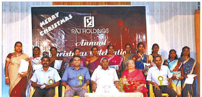
Trustees with Candidates

12 Literacy students from Alinjivakkam received certificates and a gift worth Rs. 100, during the Annual Christmas Celebration of Raj Holdings for their outstanding performance.