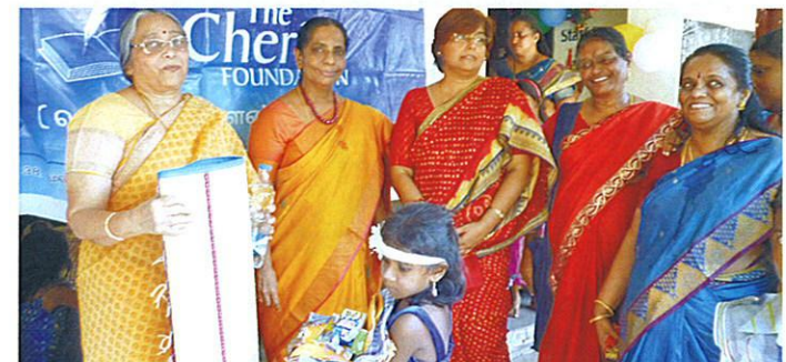
Director distributing the Flood Relief Kit