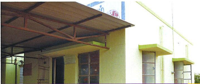
View of the PHC entrance after painting