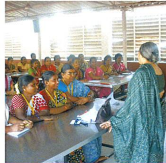
class in progress at Alinjivakkam