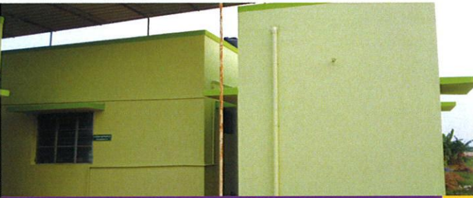
Painting Interior and Exterior