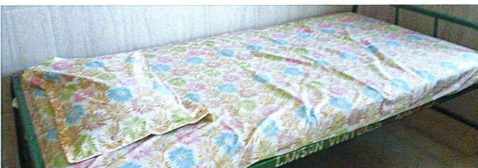
Bed sheets and pillow covers