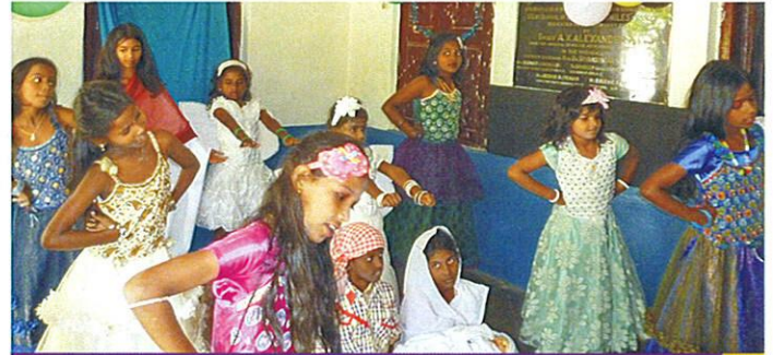
Special dance by Students

In Greams Road, through Mr.Susai. The kit included clothes and biscuits packs for 40 people.