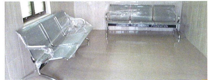
3 Seater waiting chairs and Ceiling fans