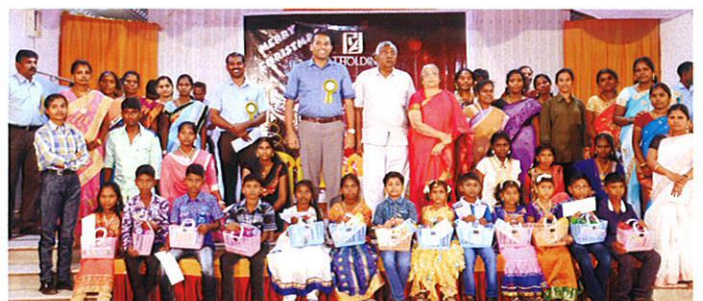
Trustees with Awardees & thier Parents

Last year we received 75 applications and shortlisted 21 candidates who secured marks above 90 percent. The shortlisted 21 Children received a scholarship amount (Total Amount is Rs. 27,000/-) and gifts based on the level of their grades, during the Raj Holdings Christmas celebration.