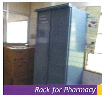
Rack for Pharmacy