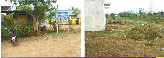
Beautification of the campus by clearing the bushes

With the funds raising events, we were able to meet the needs of an appeal, from the doctor in the Public Health Centre, Panchetty village located near Ponneri requesting us to donate the following facilities