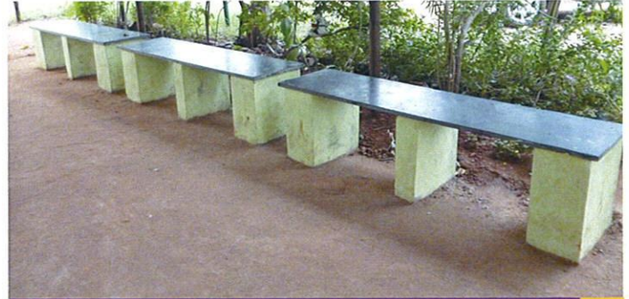
Additional kadapa stone benches in patient waiting area