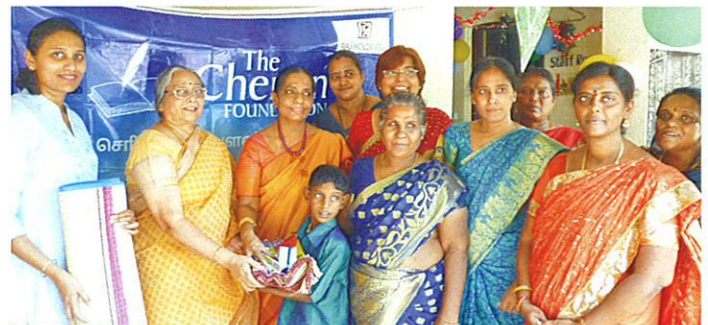
Flood Relief Kit distribution at SSLS