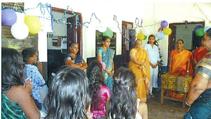
Director and Trustee at SSLS

On 22nd December 2015, we celebrated Christmas with 30 children, the QMC Principal, SSLS Correspondents and professors from various depts. On this occasion, we distributed flood relief materials to these children, which included bed sheet, pillow cover, towel, mat, Dettol soap, notebook, pencil, pen, sharpener and eraser.