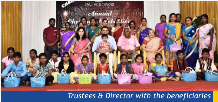
Trustees & Director with the beneficiaries

This year we received 40 applications and shortlisted 14 candidates who secured marks above 95 percent. TCF awarded Rs18,000 as scholarship for the children based on the level of their grades, during the Raj Holdings Christmas celebration.