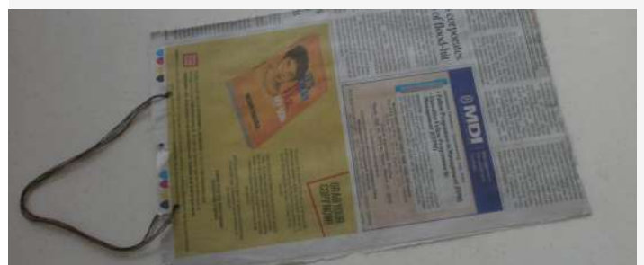
Disposable Paper Bag made out of old Newspaper

We now make our own paper bags with the help of our literacy class students for proper disposal of the soiled sanitary napkins at Alinjivakkam. The paper bags are kept in all the restrooms. This work is done on a regular basis as per the requirement.