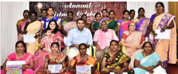
Outstanding Students receiving certificates

10 students from Alinjivakkam and 8 students from Mugappair scored well in their literacy tests. They received certificates and prizes during the occasion of Annual Christmas celebration.