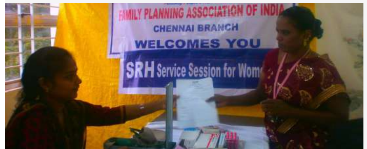
Beneficiary received detailed report and Medicine

On 1st December 2016, TCF conducted a Cervical Cancer Screening Camp at Alinjivakkam with the help of the medical team from 'Family Planning Association of India'. Around 30 women between the age group of 35-45, were examined. 20 women were referred to ESI for blood & sugar test and no pre-cervical cancer abnormalities were found.