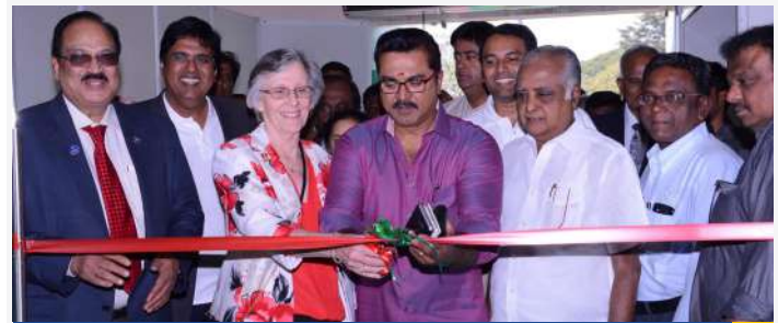
Inauguration of Rotary Expo