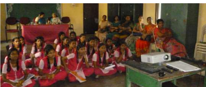
Demonstration of E-learning Kit

E -Learning Solution kit with "Samacheer Kalvi" syllabus is specially designed for the Govt. & Govt. aided schools in Tamil Nadu. On 21st September 2016, Director of TCF, had an interactive session along with a demonstration of the kit at Guntur Subbiah School for the 11th Std students.