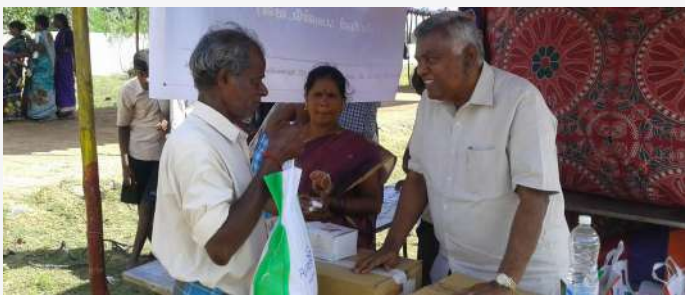
Trustees interacting with Beneficiary

In the aftermath of the December floods of 2015, we distributed a kit with 5kgs of Rice, 1 kg of dal and 5 soaps on 03rd Jan 2016 at Kezhar Kollai Village and on 9th Jan 2016 at Thenpattinam village. Totally 377 families benefited.