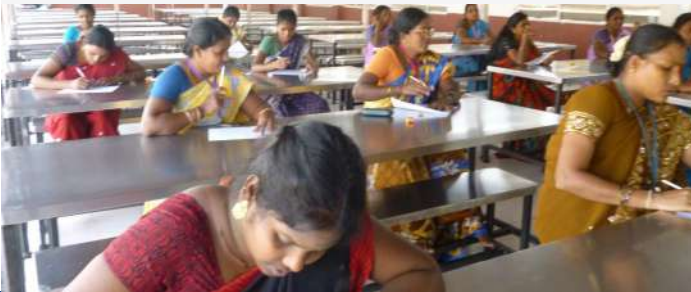
evaluation test in progress at Alinjivakkam

20 candidates from Alinjivakkam and 10 candidates from Mugappair benefited through this programme. Regular tests were conducted to understand their progress. They are now able to read, write and also maintain their own records in their respective work area.