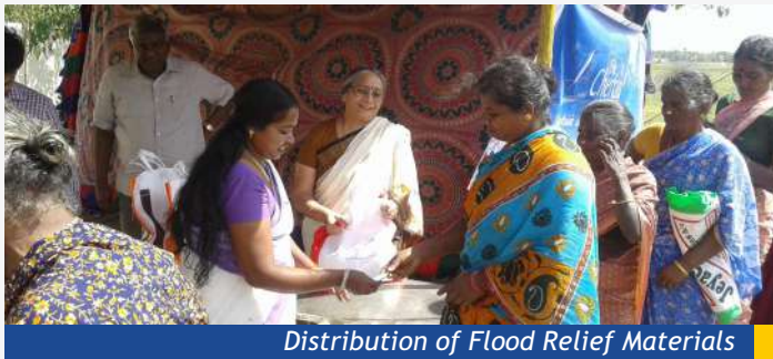
Distribution of Flood Relief Materials