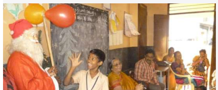
Special Dance by Students

We distributed cakes to 181 children on 23rd December 2016. Children sang carols and conveyed their wishes and thanks to the trustees.