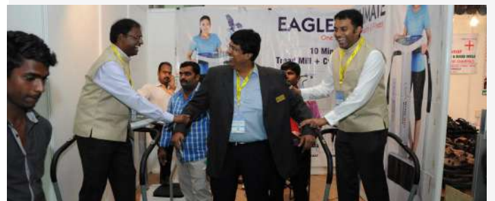
Trustee at Fitness Stall