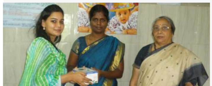
Chairperson MMLC#4 handing over to Chief Doctor