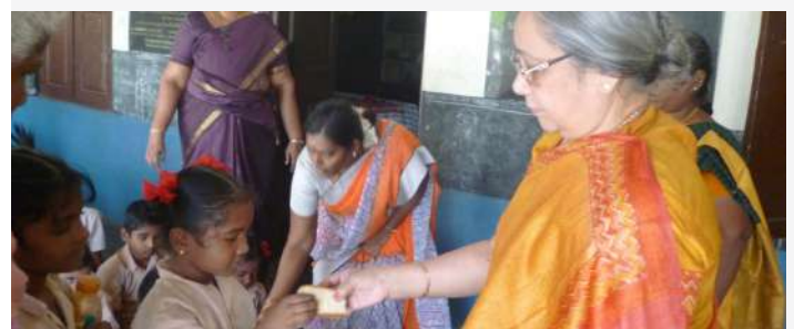
Director distributing Cakes

On 22nd December 2016, we celebrated Christmas with 35 children