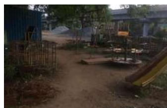
Existing children's park at the Cancer Institute