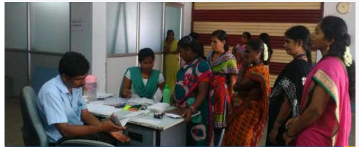
Staff registering the details in the Medical Card