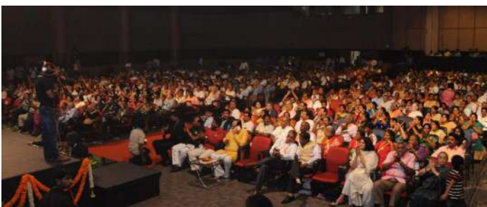
Audience at Rotary Dist. Conference UTSAV