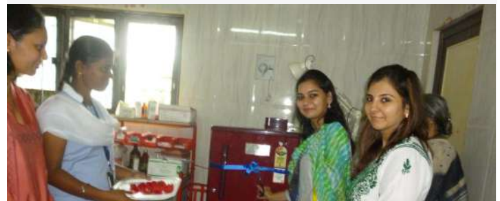
Fridge with Stabilizer for keeping medicine

•.With this amount, we were able to purchase the following items: