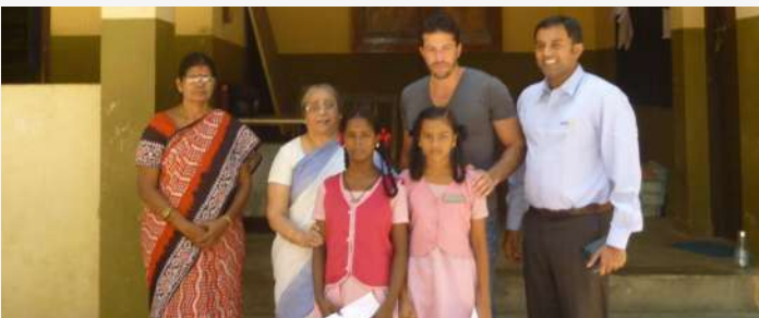
Trustee & Director with the beneficiaries