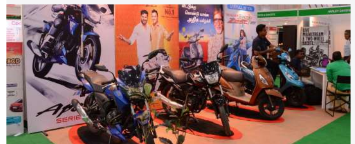
Life Style Stall