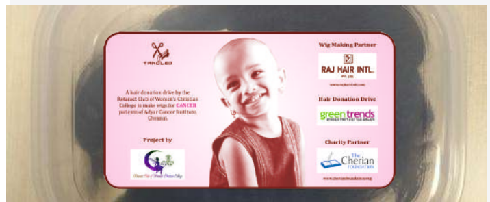
Wig for the Cancer Patients