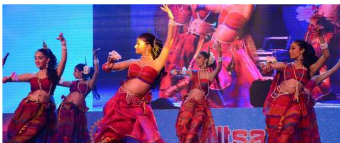
Evening Entertainment - International Dance